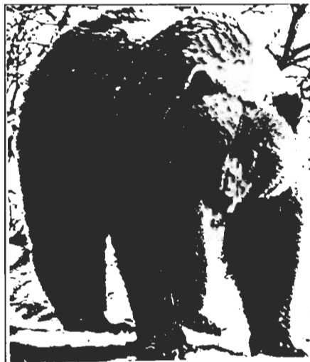
Yellowstone Grizzly Bear waits for foolish tourists. Note chips on shoulder.

"Rogue didn't hit the ground more than about three times on the way," he